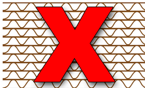
10 Corrugate C-Flute .150pt sheets